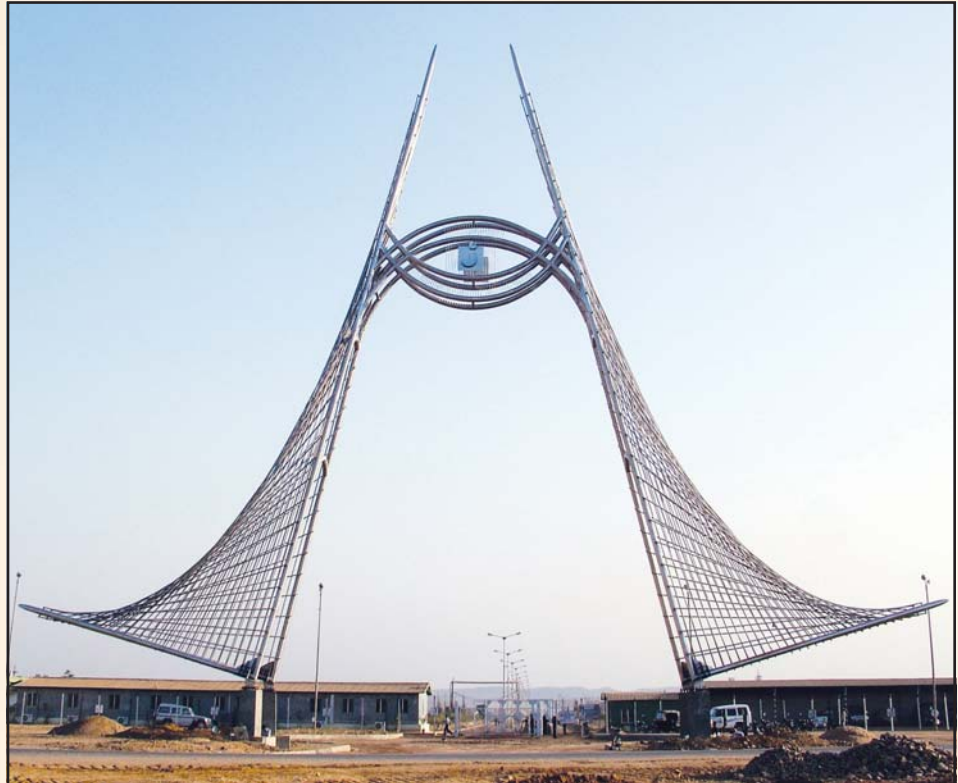
33m high gateway, India's tallest Architectural marvel in stainless steel, weighing approximately 20 metric tons. It is an excellent example of application of stainless steel as a structural material.

provide a range of technical support services for stainless steel applications in Architectural, Building & Construction works.