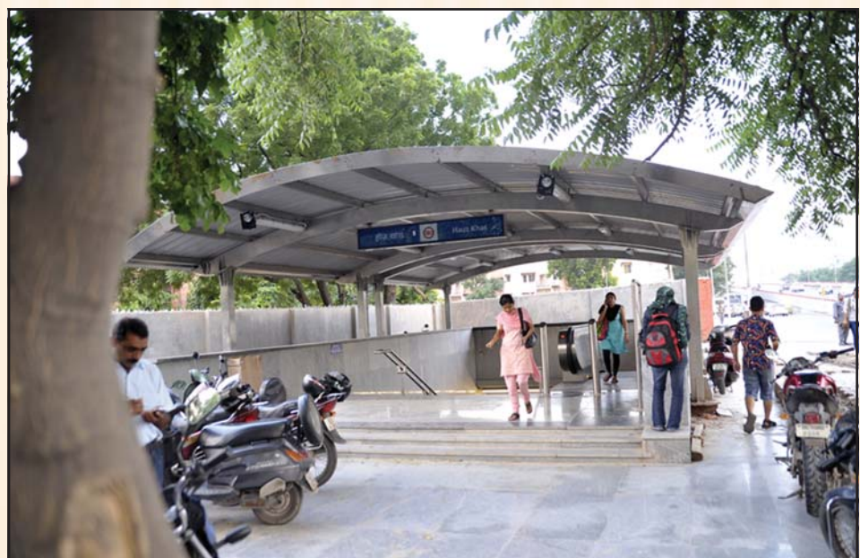
A different design of canopy at Hauz Khas metro station

The canopy consists of 219 mm diameter stainless steel pipes with profiled stainless steel sheets, pipes and Box sections for the roof structure. The roof