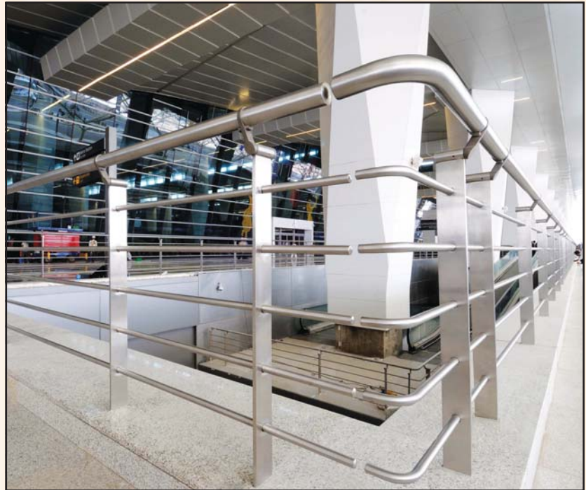
Departure Forecourt at the Passenger Terminal Building