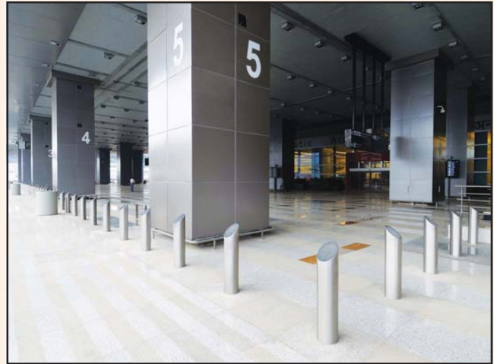
Crash bollards at PTB Arrivals and Departure

The EPC (Engineering, Procurement & Construction) contractor for stainless steel works in the sections of T3 mentioned above was Fabrinox, the Architectural Division of M/s Dharam Industries, a member company of ISSDA. Fabrinox designed, fabricated and installed the stainless steel items indicated.