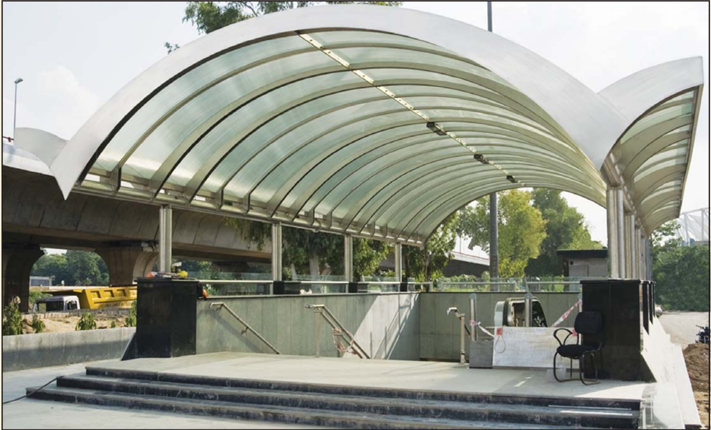
Gleaming stainless steel entrance canopy at the Jawaharlal Nehru Stadium metro station in Delhi

M/s Jindal Architecture Ltd has designed, fabricated and installed the first of its kind elegant stainless steel canopy structures at the main entrances of Delhi Metro Rail Corporation (DMRC) underground stations on the new Badarpur line. The huge stainless steel canopy structures measure 17m in length; 10m in width and 4m in height.