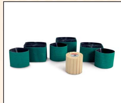
Wheels for applying Matt/Satin Finishes

Before applying any of these final finishes, please make sure that the last grinding operation was by 120 grit grinding medium. First apply Matt finish, which is the rougher of the two finishes. The Blue and Green wheels in the image above are for this purpose. They give you a surface roughness value of less than 0.7 microns.