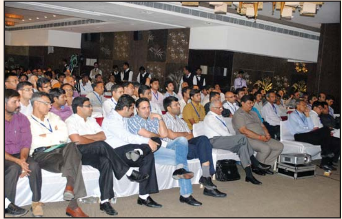
A section of the audience at the workshop