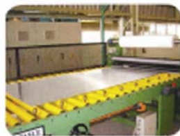
SCOTCH BRITE POLISHING LINE