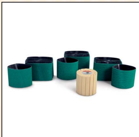
Set of wheels and belts for grinding (Metal removal)

High speed grinding does not speed up your productivity. On the contrary, it is positively more expensive for you both in terms of time and money.