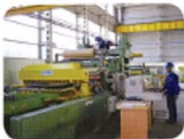
CUT TO LENGTH LINE

Facilities Installed: The company is equipped with the latest technologically advanced Slitting, Cut-to-Length & Surface Polishing Lines (No.4, Scotch Brite, Mirror Finish, Anti Fingerprint Finish & Embossing) from the best international equipments suppliers Like FIMI & IMEAS of Italy and DAHEWA of Korea.