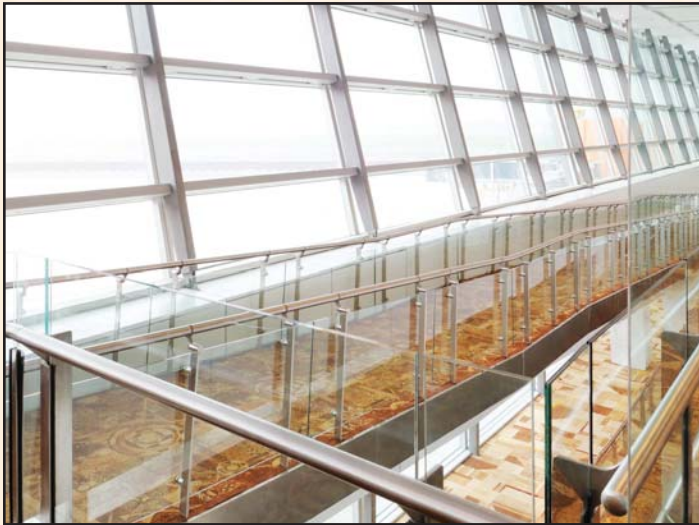
Top of Ramps in the boarding area of domestic pier