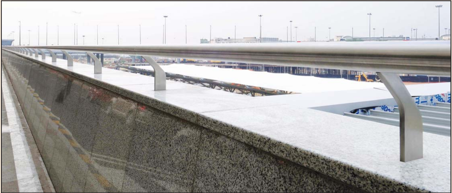
Parafit Railings in Passenger Terminal Building (PTB) Departure