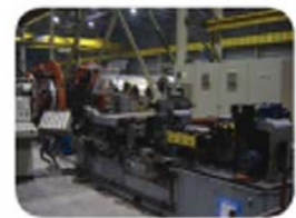
GORE BAR (FLAT BAR LINE)

For details of services available, Please contact JSSL MARKETING TEAM: