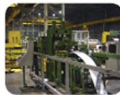
NARROW CTL LINE