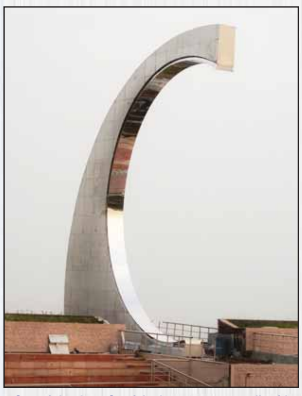
One of the three Semi Arches, 15 meters tall, with stainless steel cladding