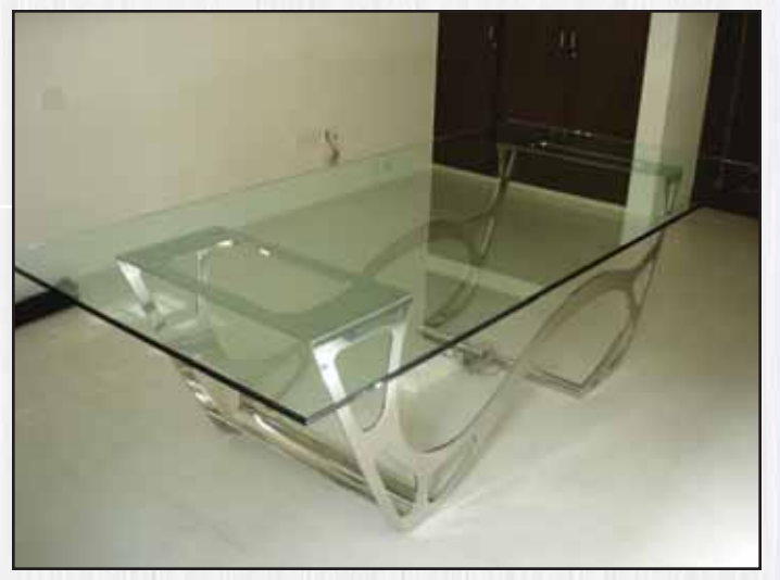
Conference Table for 10

ISSDA and Nickel Institute offices are operating from L-22/4, GF, DLF Phase-II, Gurgaon 122 002, Haryana. Phones: 91-124 4375 501, 02, 03 Fax: 4375 509