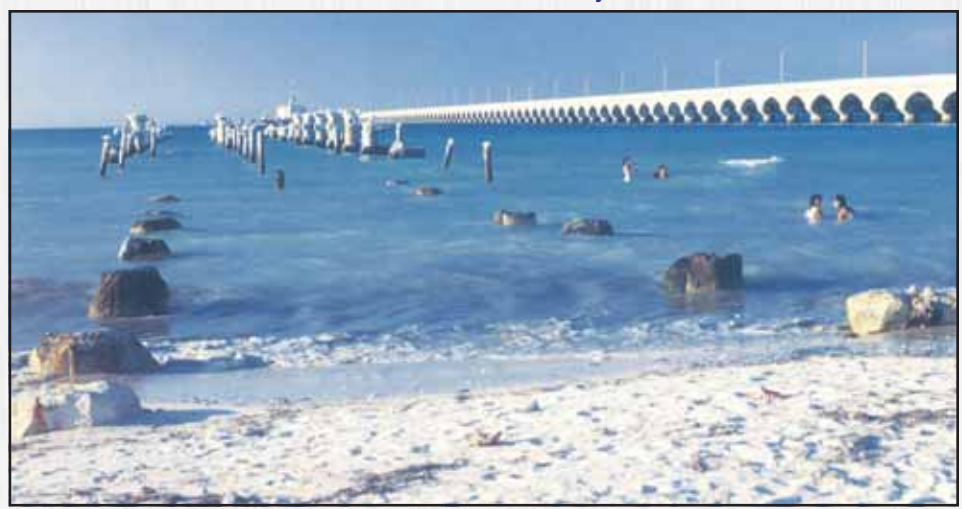
Tale of two bridges at Progresso in Mexico, A study in contrast

The bridge in the foreground in picture on the top (in shambles now) was built with carbon reinforcing bar in the 1960s and closed in 1982; only its remains are seen! The bridge in the background was completed in 1941 with stainless steel rebar – 70 years old and good for another 20 years WITHOUT ANY MAINTENANCE.