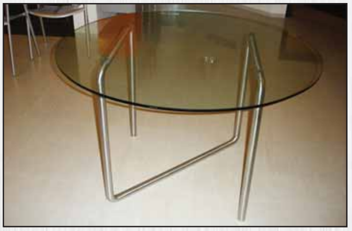
Dining Table for four