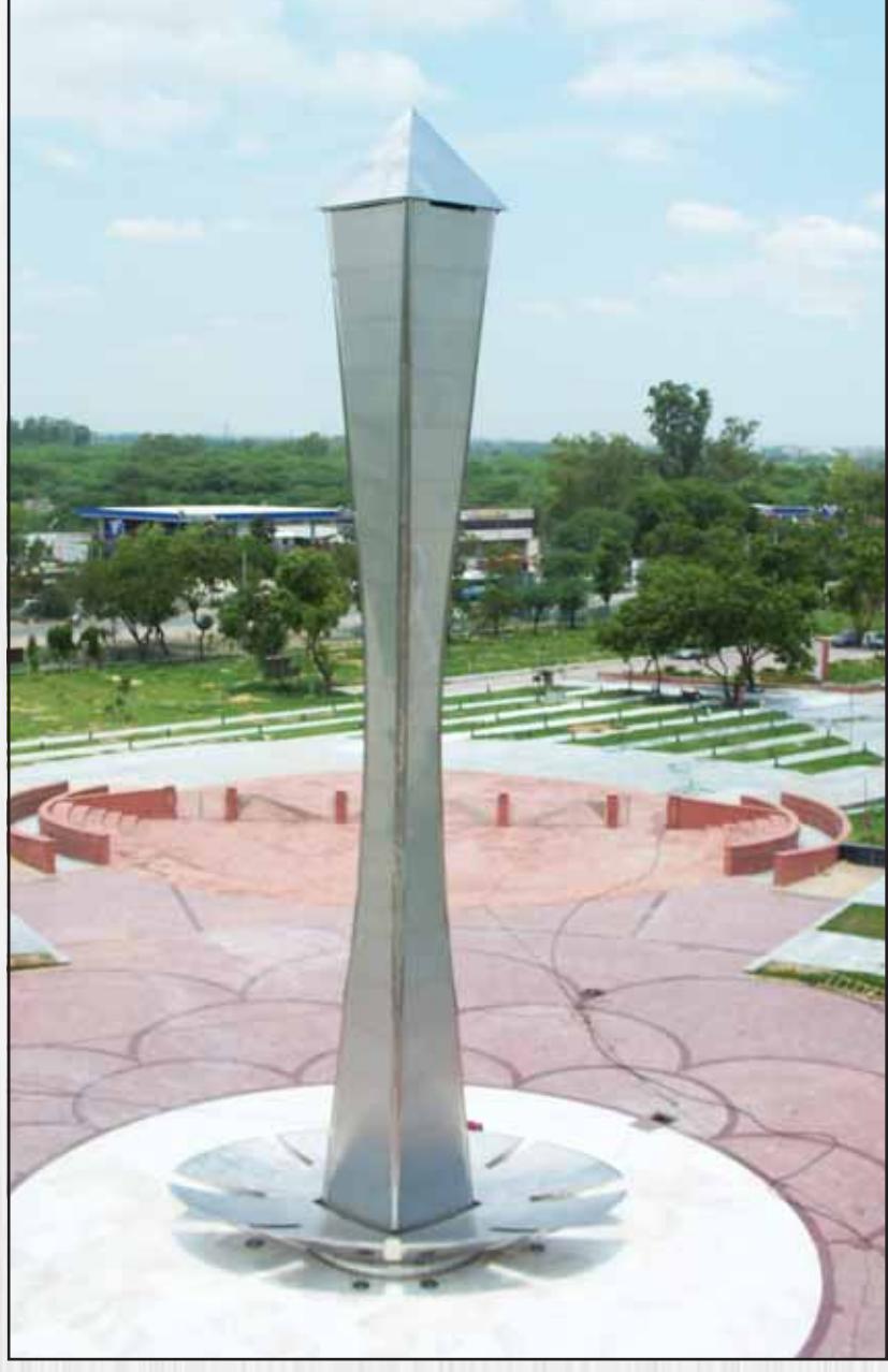
Central Pylon clad in stainless steel is 24 meters tall. The Lotus is elliptical with a mean diameter of about 8 meters.