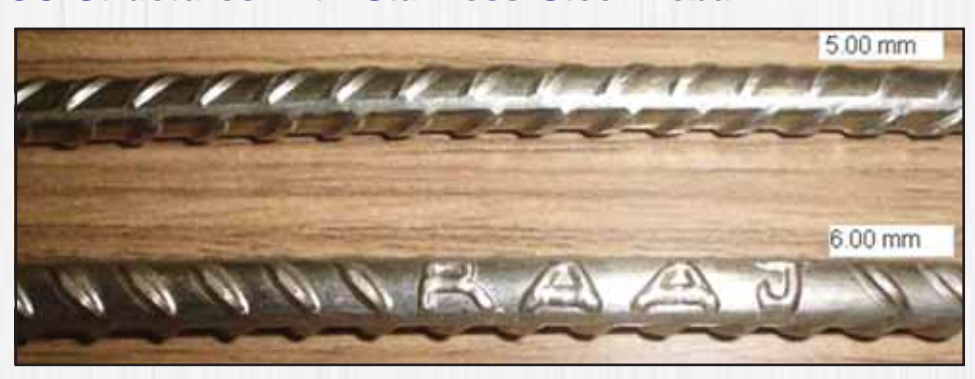
Stainless rebars from Raajaratna

Ph: +91 79 27543681/82/83 Mob: +91-98-25122299 Mail: manish@raajratna.com Web: www.raajratna.com